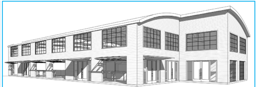
Architect Rendering of revitalized Bluepeter building for use in public serving capacity