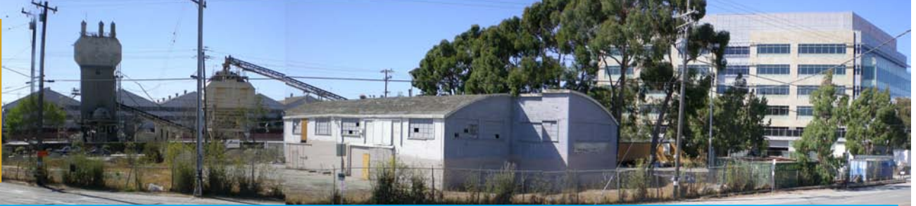
The Bluepeter building located in southernmost tip of Mission Bay at intersection of Terry Francois Blvd./Mariposa St./Illinois St.

A future meeting place at the crossroads of Dogpatch, Potrero Hill and Mission Bay!